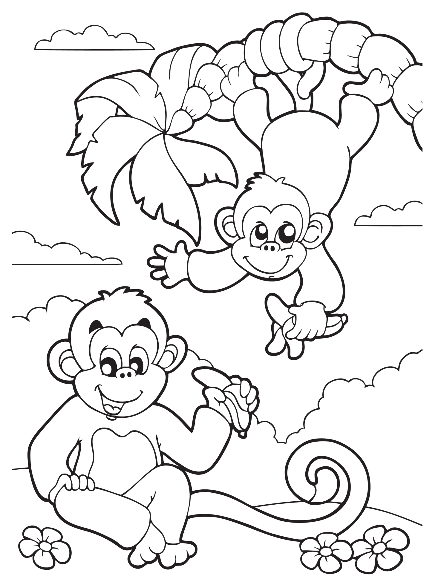
I'm Marvin and my best friend is Chappy. Swinging from trees makes us happy.